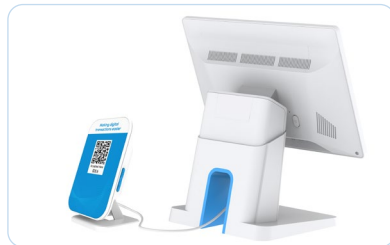
External Cash Register