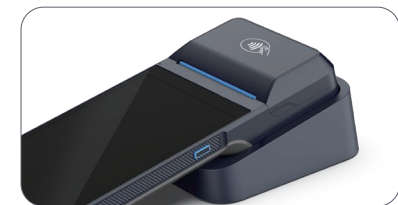
Charging Cradle (Optional)