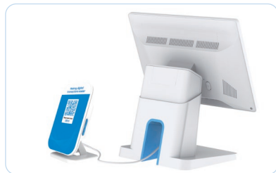
External Cash Register