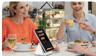
Tabletop Self Service