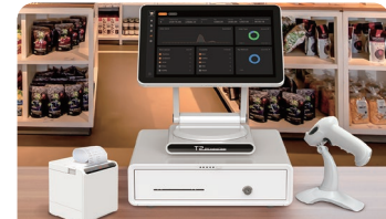
Swivel Cashier Kit