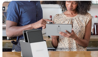
Multi-tab Charging Station