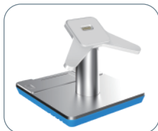
Magnetic Dock Stand